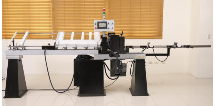
PVC BOTTOMRAIL AUTO-POSITION DRILL MACHINE

Drilling holes simultaneously PLC control system Auto-position function