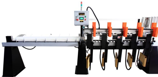
AUTOMATIC THREADING SLAT MACHINE